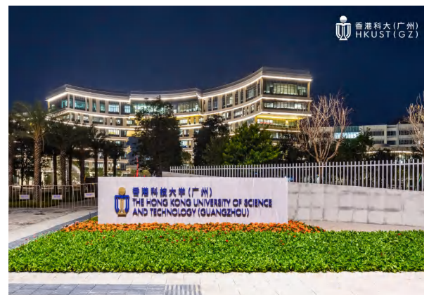
Entrance of Gate 1, HKUST(GZ) campus