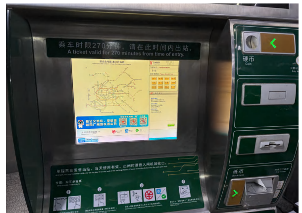
Metro ticket vending machine