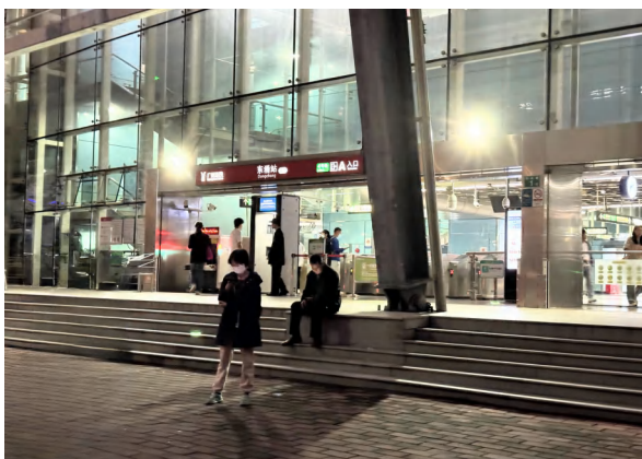
Exit A of Dongchong station